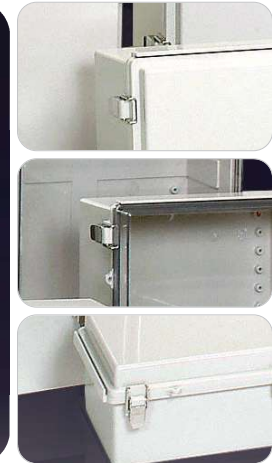
*속판 규격은 플라스틱 속판 기준이며, ( )안은 철 속판 규격임. The dimension of mounting plate is based on the plastic mounting plate and the dimension of around bracket is steel mounting plate